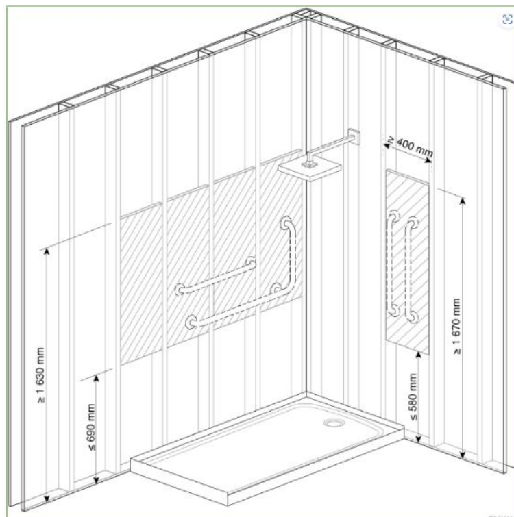
Example 1 of 2

Building and Permitting 1435 Water Street Kelowna, BC V1Y 1J4 TEL 250-469-8960 FAX 250-862-3314 developmentservicesinfo@kelowna.ca