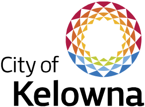
Example 2 of 2